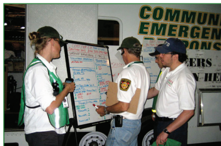
This was a CERT call-out to assist during the Station Fire. CERT members were a great help at such an awful time by directing traffic, giving directions & patrolling the Fire Fighting Staging Area at Hansen Dam. This freed up emergency personnel for more critical tasks.